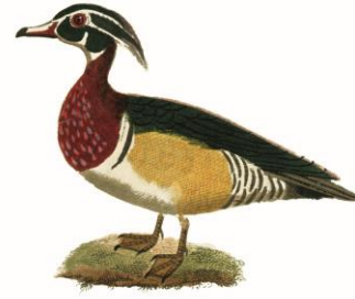
Le bean Canard huppe (Georges-Louis Leclerc)

Finally, we'll soon need to pull together a nominating committee to select next year's officers. If you would like to serve on this committee, please get in contact with me ( Youkerd@aol.com 757 344-9385).